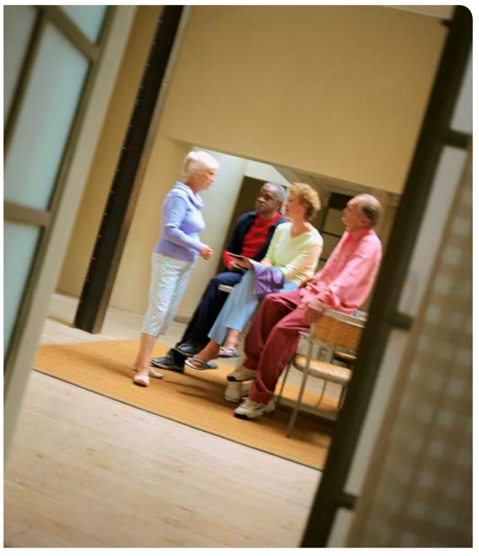
Connecting with friends or joining a stroke support group may help you cope with your changing emotions.